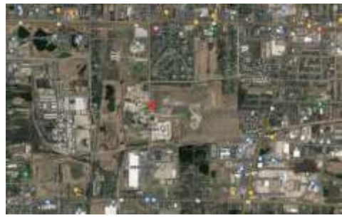
Kestrel Hawk Landfill